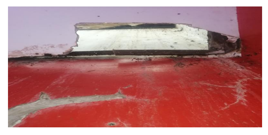
LEAKING ROOF MAIN HALL AFFECTING BRICKS