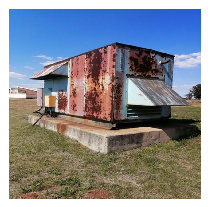
LEAKING ROOF SIMULATION & EXAM ROOM