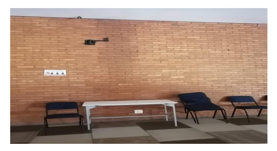
LEAKING ROOF MAIN HALL