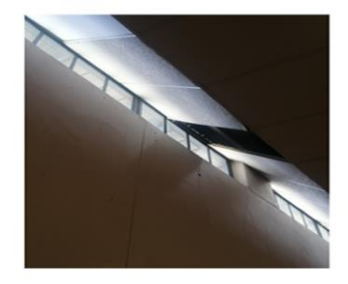
DAMAGED BATHROOM CEILINGS AT STUDENT RESIDENCES