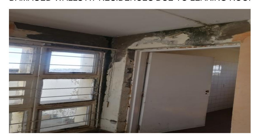
LEAKING ROOF AT RESIDENCE